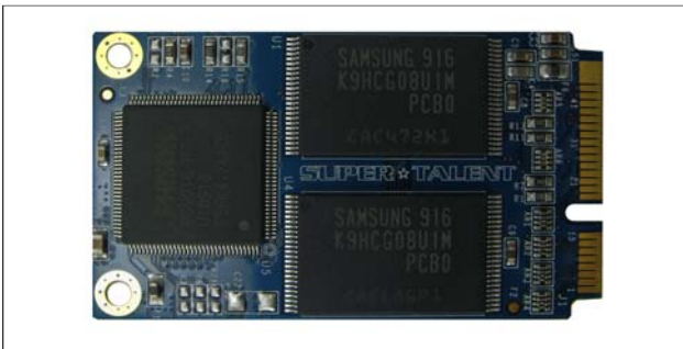
Half Mini 2 PCIe SSD

The Half Mini 2 PCIe SSD is an upgrade module specifically designed to be a drop in replacement for the Dell Inspiron Mini 9 netbook PC. The modules are available with both MLC and SLC Flash memory. The modules are simple and easy to install for immediate capacity and performance benefits.